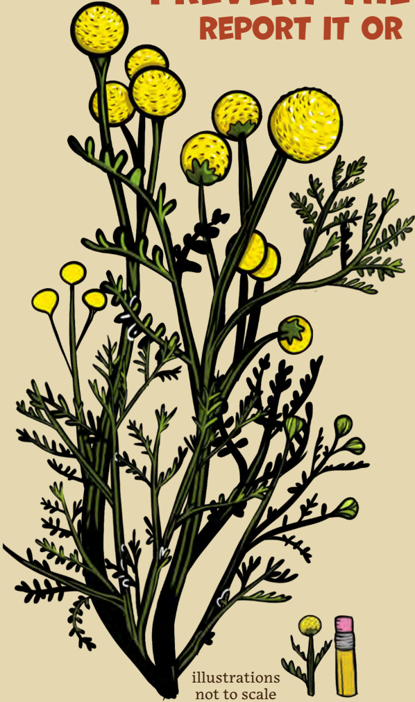
illustrations not to scale

PREVENT THE SPREAD REPORT IT OR PULL IT!